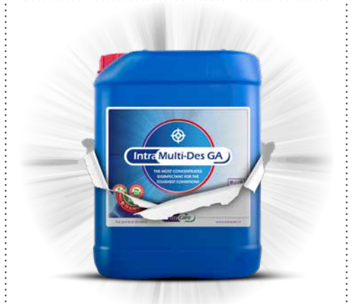
4 Brand new update!