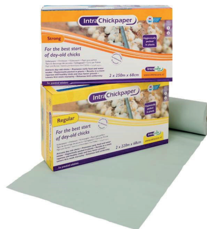
Intra Chickpaper Strong & Regular

For the broiler farmer Intra Chickpaper will be the tool to guide all hatchlings as soon as possible to feed and water. Fast access to feed will result in use of the egg yolk for intestinal and immune development. A healthy intestine and a good level immunity protects the chicks against invasion by pathogens and intestinal diseases.